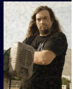
Todd Sheets Paranormal Files